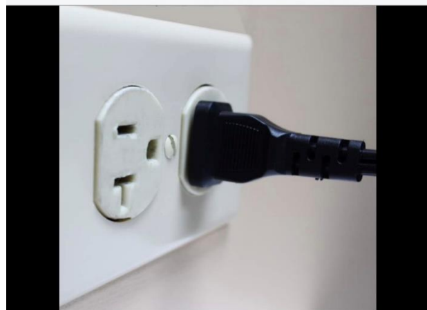
LUMA Energy En momentos de fluctuaciones de energía, asegúrate de apagar interruptores de electricidad y de desconectar equipos eléctricos. Protege equipos como neveras y estufas con protectores de voltaje. #LUMA #SeguridadPública Timeline photos · Oct 12, 2021 · 🌐 View Full Size