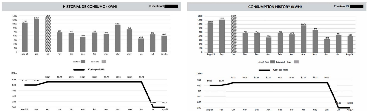
Figure 1-3. Current LUMA Customer Bill: Consumption History Detail (Spanish and English)

LUMA proposes to update the Consumption History (kWh) graph on the fourth page of the Model Bill to reflect and clearly identify the bill adjustment. With the proposed modification, the chart will display the adjusted month as a white bar, as illustrated in Figure 1-4.